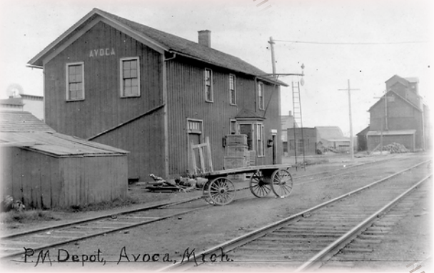
Above: An undated postcard shows the Avoca Depot, looking northwest. The Avoca grain elevator, which still stands today, can be seen in the background.