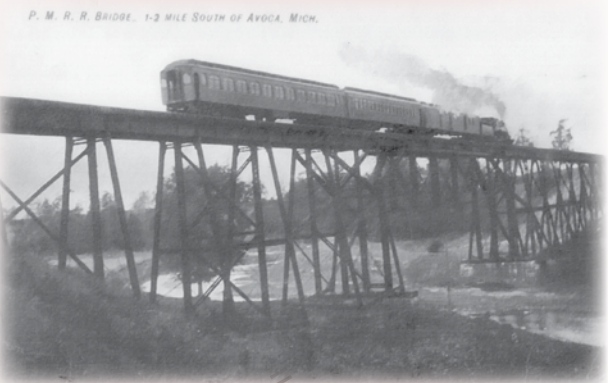
Above: A postcard from around 1900 shows a passenger train crossing the Mill Creek Trestle.

The Port Huron and Northwestern Railroad Company opened the narrow gauge railroad from Port Huron to East Saginaw in 1882. In 1889, the railroad was sold to the Pere Marquette Railroad and the tracks were changed to standard gauge. The St. Clair County Parks and Recreation Commission purchased the right of way from the CSX Railroad in 1999.