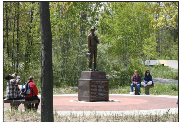
Above - The Tunnel Memorial sits directly above the tunnel and the miner looks out towards Lake Huron. The granite block below the miner is engraved with the names of the victims of the accident.