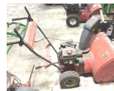
MTD walk behind snow blower,