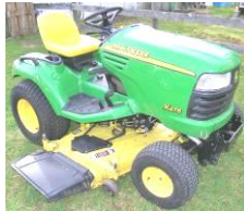
John Deere X475 garden tractor, Hydro stat, 62" edge mower deck w/51" front quick hitch broom, (blown motor.)