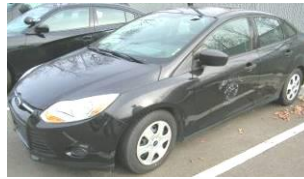
2) 2014 Ford Focus (L & Reverse only) 54,409 mi,