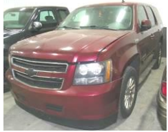
2008 Chevrolet Tahoe K1500 Hybrid, 6.0 engine, 4wd, maroon, 192,047 mi,