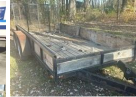
Landscape trailer, tandem axle w/drop gate,