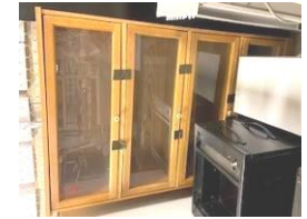
2) Wooden/glass cabinets,