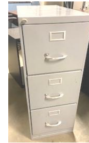
Filing cabinets: 1 each- 3, 4,5 drawer