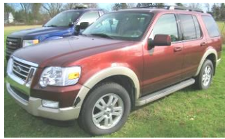
2009 Ford Explorer 4 X 4, burnt orange, 94,732 mi,