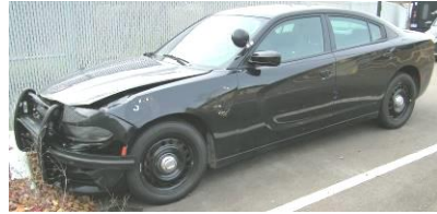
2018 Dodge Charger, AWD, damaged front end, 1116,325 mi,