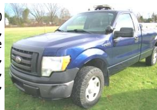
2009 FORD F150 4WD pick up 8' box, WeatherGuard side & across the bed, alumn. Tool boxes, 110,612 mi,