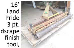
16' Land Pride 3 pt. landscape finish tool,