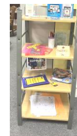
Metal shelf unit,