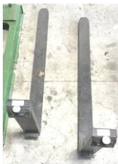
John Deere tractor forks,