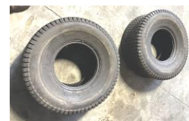
Turf tires: 4) large, 4) small,