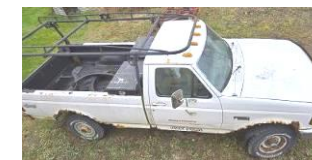
1995 Ford F250 4wd, pickup, 5.8 L V-8 A/T, lock out hubs, Meyers pump 8' Western snow plow, ladder racks, (no brakes-line rusted out),