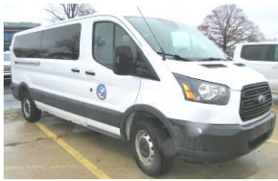
2016 FORD Transit 350, 3.7 L. AT pass. Van, white, 233,641 mi, Frt. Dmg.