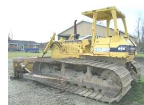
Komatsu D68P lg. dozer, 12 ft blade, 37-1/2" wide track pads, $5,000 worth of new parts, track pads & blade parts, shows 3650 hrs, -dozer is located at 3380 Keewahdin Rd, Ft. Gratiot, MI,

TERMS OF SALE: are CASH DAY OF SALE. Cashier's Or Traveler's Checks, Bank Money Order, Michigan Personal Or Company Checks ONLY WITH Bank Letter Of Authorization. Payment Is Required In Full On Day Of Sale. Nothing Is To Be Removed Until Settled For - All Sales Are Subject To 10% Buyers Premium and 6 % Mi Sales Tax