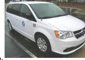
2018 Dodge Grand Caravan, 2010 white, Chevy Tahoe, 2wd, white, 188,619 mi,