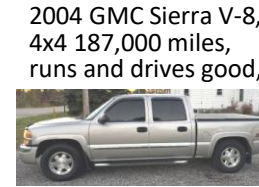
2004 GMC Sierra V-8, 4x4 187,000 miles, runs and drives good,