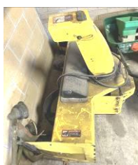
2) John Deere 47" snow blower w/ shafts.