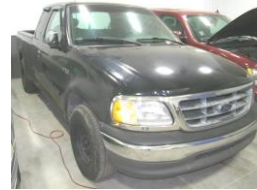
2002 Ford Pickup, ext. cab, 2wd, black, 213,833 mi,