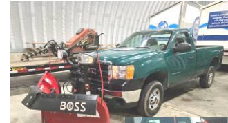
2013 GMC Sierra 2500, 4 wd pickup 8' box, 8'2" power V-Boss plow & TGS 600 rear salt spreader,