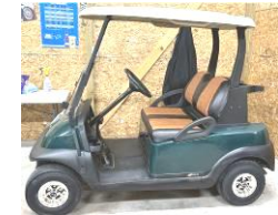
2005 Club Car gas runs good,