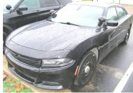
2021 Dodge Charger, AWD,