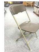
(8) Metal chairs,