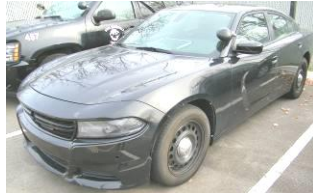
2018 Dodge Charger, V-8 Hemmi, AWD, 111,075 mi,