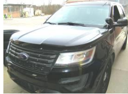
2016 Ford Explorer, 55,126 mi,