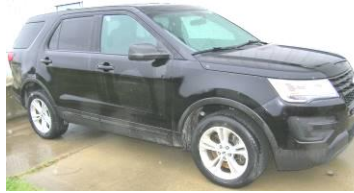
2018 Ford Explorer AWD, 3.7L Grp, 4 dr, flex fuel, cloth interior, blk, 55,453 mi,