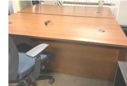
2) Large wooden desks,