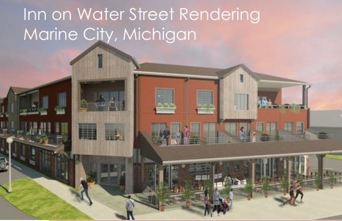
Inn on Water Street Rendering Marine City, Michigan

Brownfields are defined as properties that are contaminated (or perceived as contaminated), blighted, functionally obsolete, or historic resources.