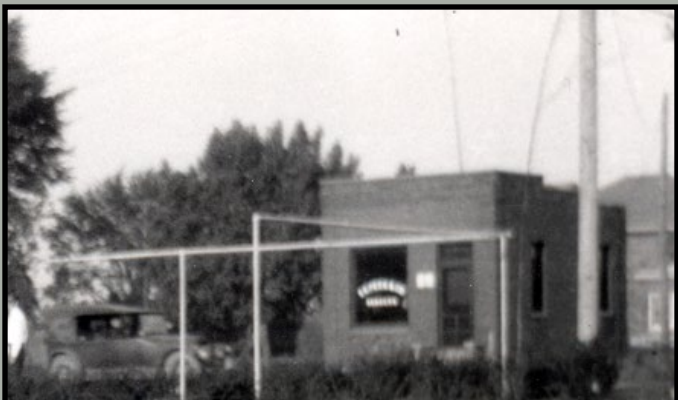
The bank as it appeared in the 1920's.