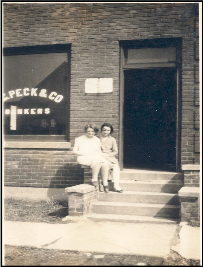
McCue relatives pose for a picture in front of the bank.